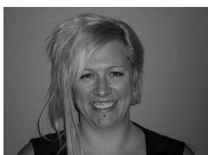
Youth Coalition of the ACT and Families ACT